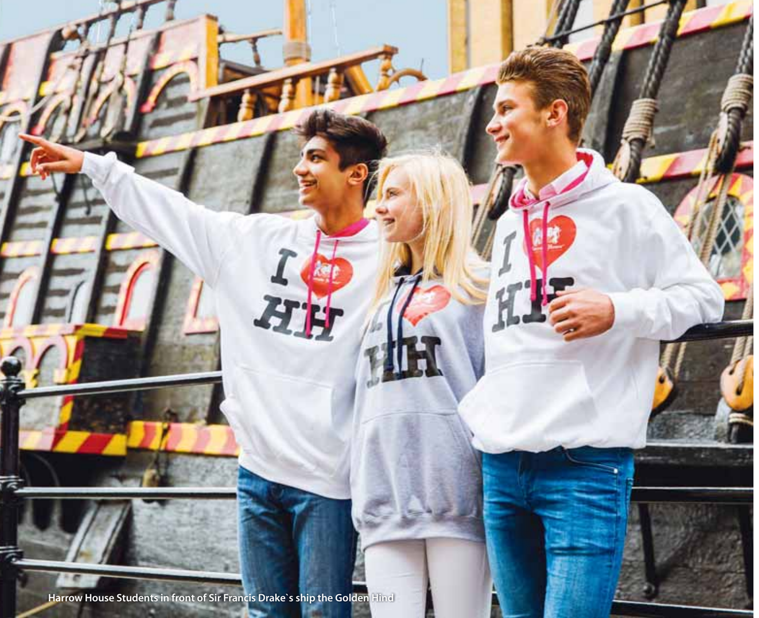
Harrow House Students in front of Sir Francis Drake's ship the Golden Hind