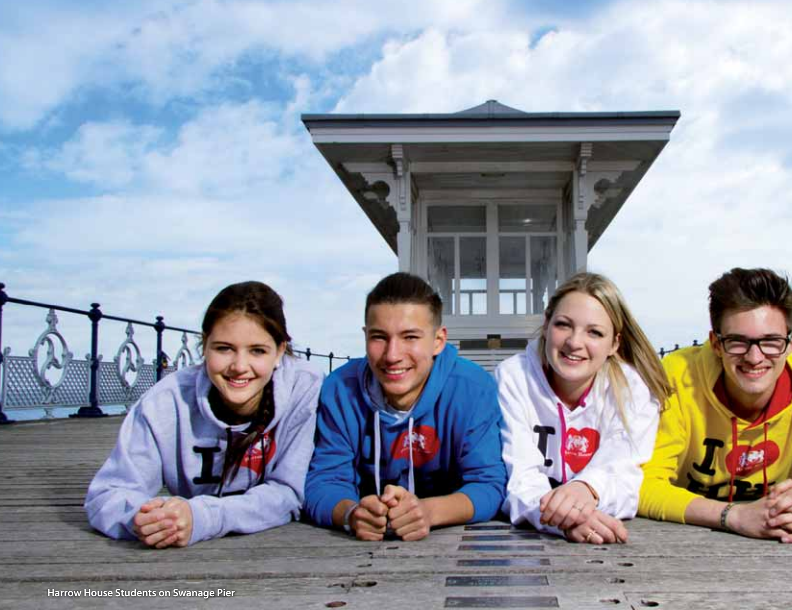
Harrow House Students on Swanage Pier