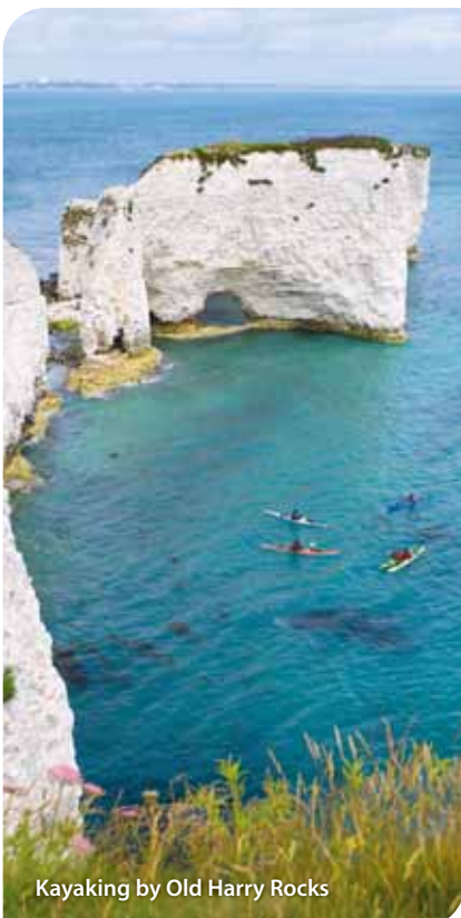
Kayaking by Old Harry Rocks