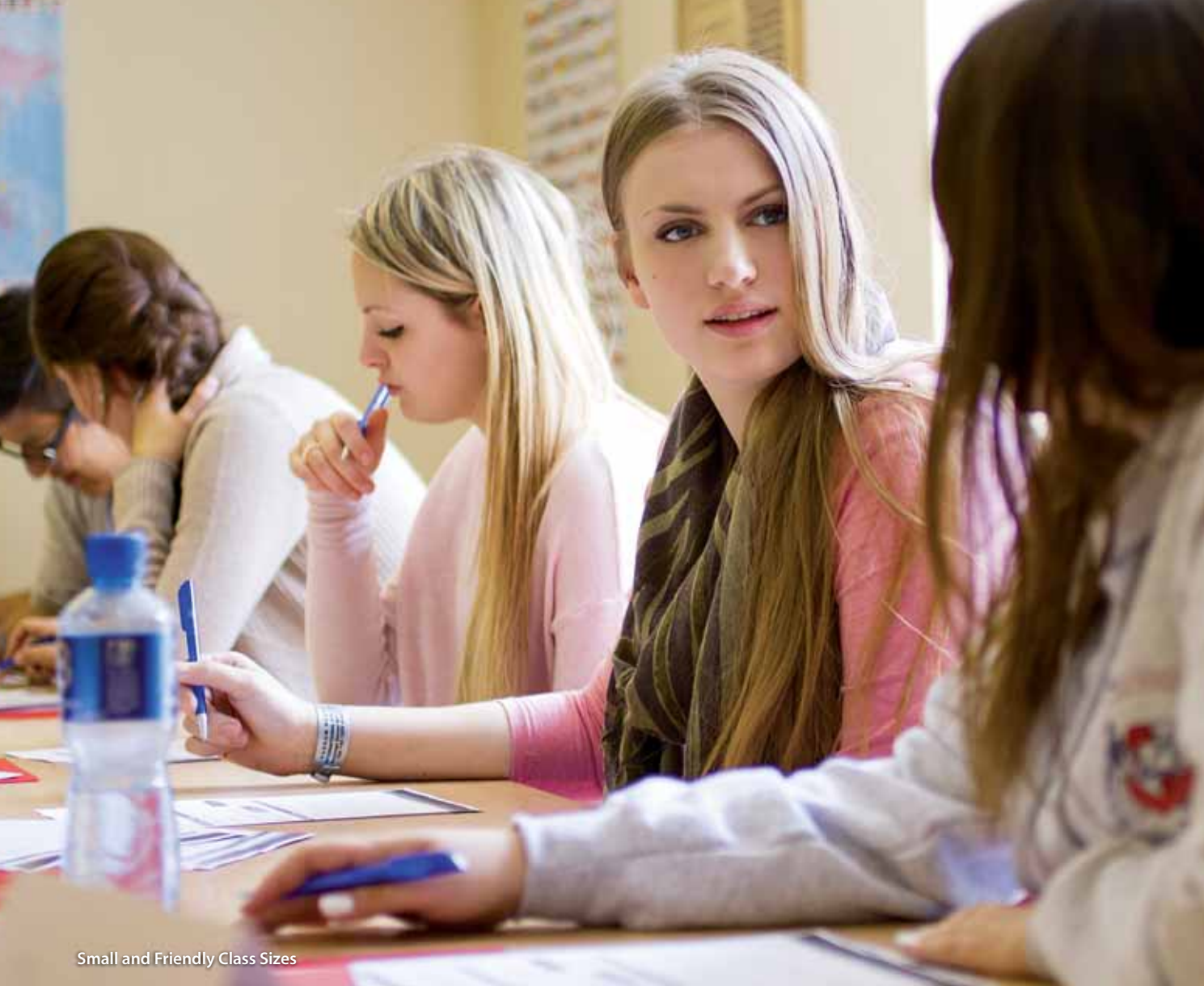
Small and Friendly Class Sizes