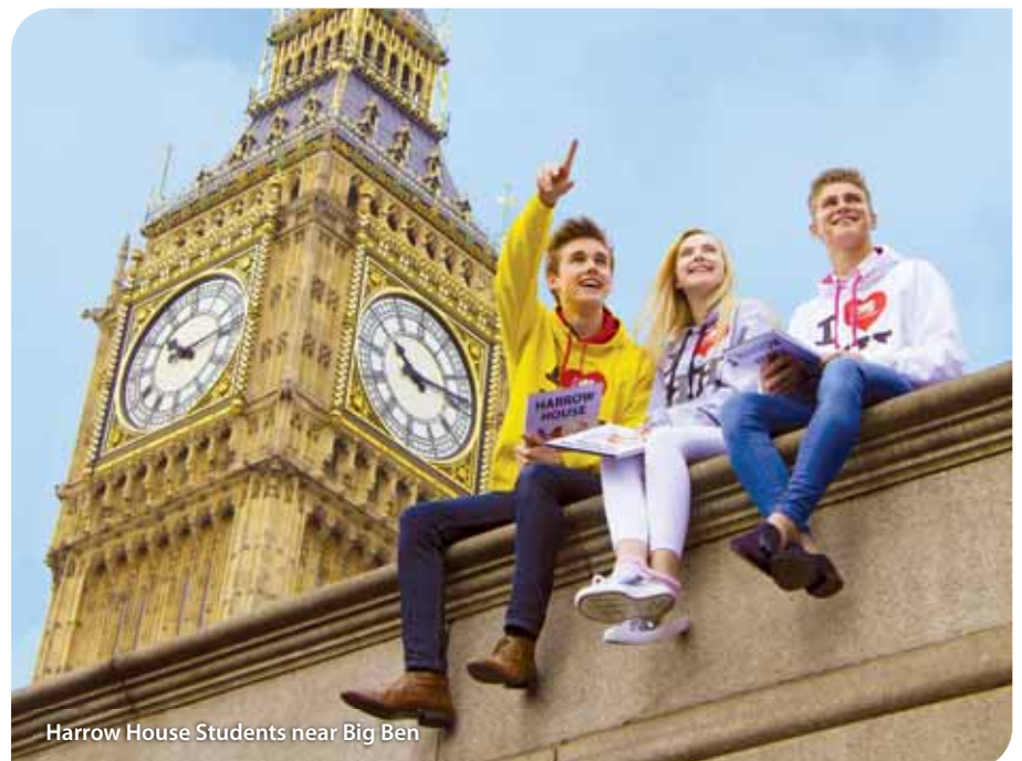
Harrow House Students near Big Ben