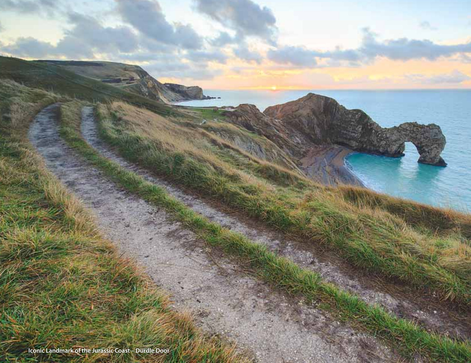
Iconic Landmark of the Jurassic Coast – Durdle Door