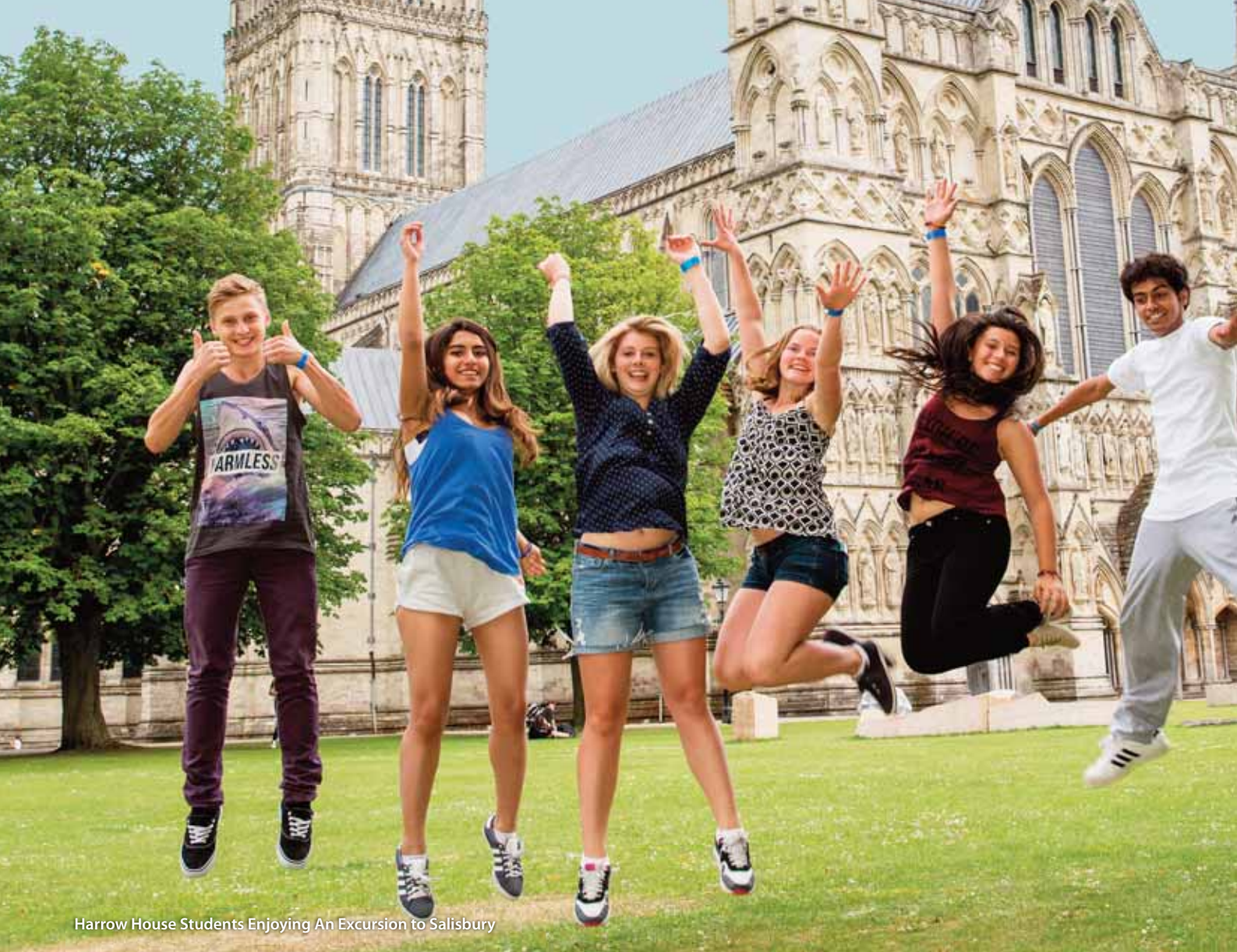
Harrow House Students Enjoying An Excursion to Salisbury