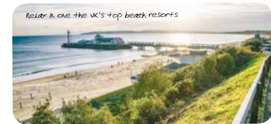
Relax in one the UK's top beach resorts