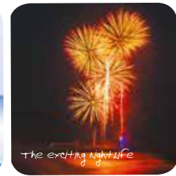
The exciting nightlife