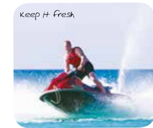
Keep it fresh