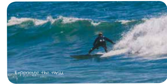
Experience the thrill