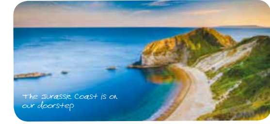
The Jurassic Coast is on our doorstep