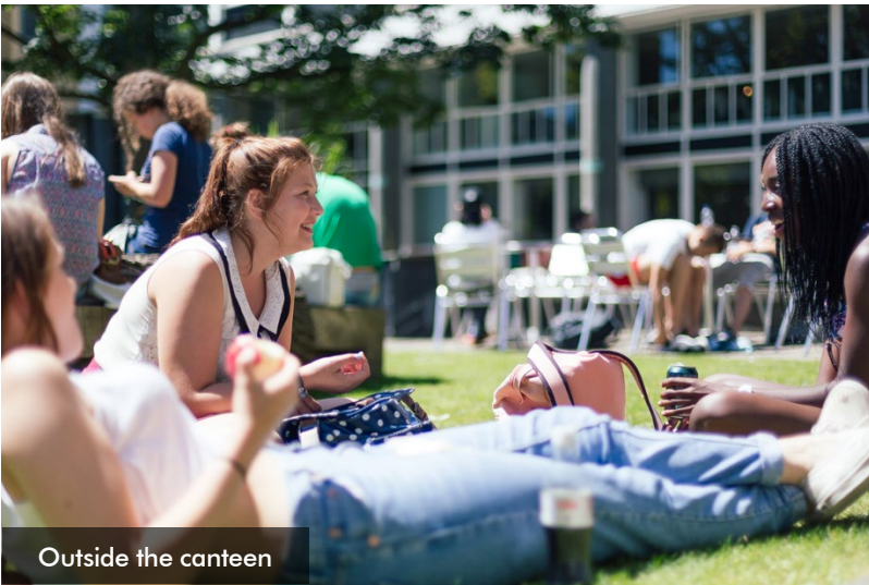
Outside the canteen