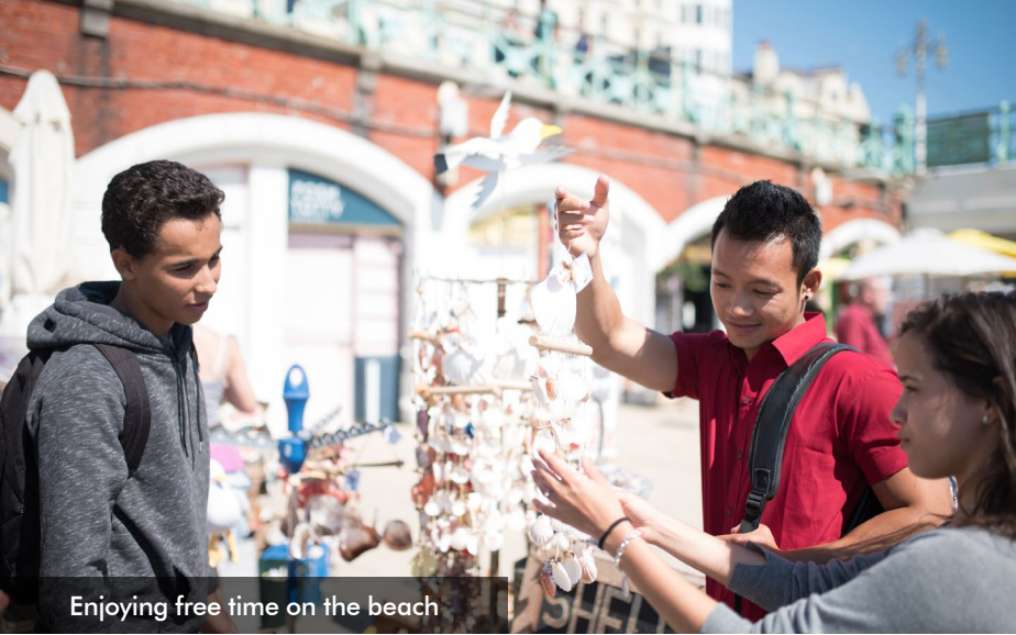
Enjoying free time on the beach