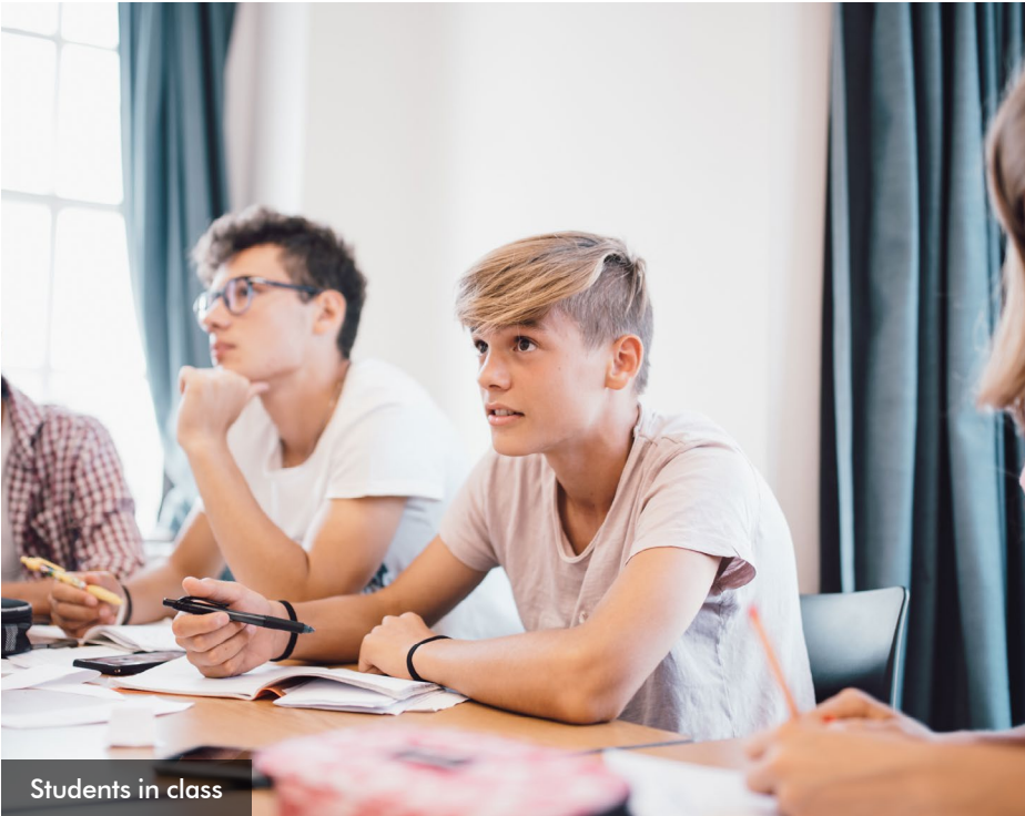
Students in class