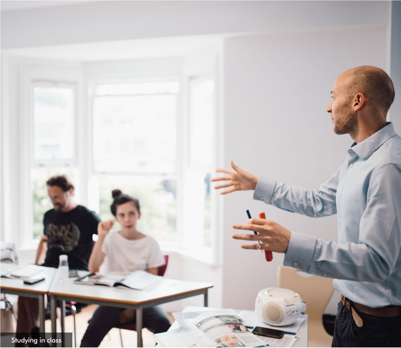
Studying in class