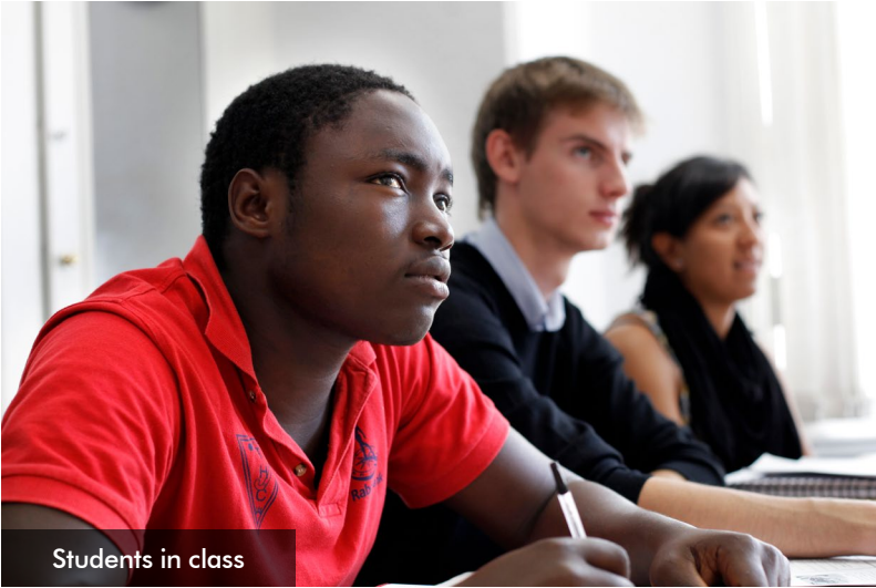
Students in class