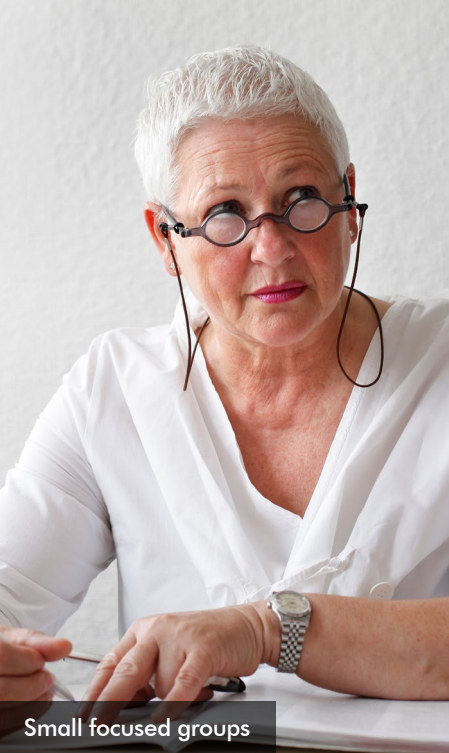
Small focused groups